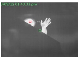
Search and rescue